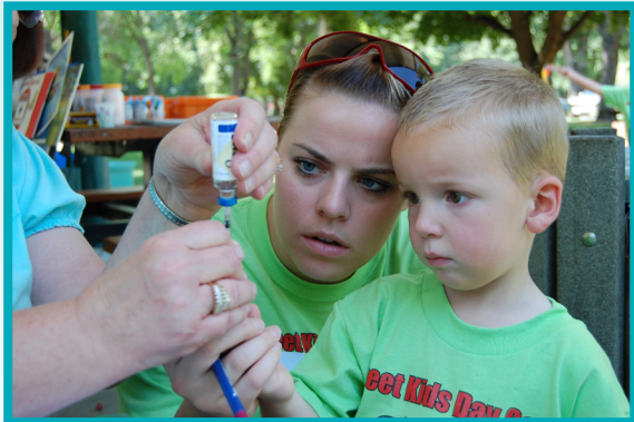
Learning about insulin shots at Sweet Kids Day Camp 2009